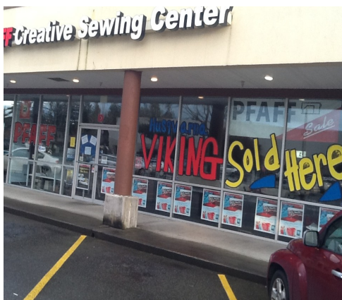
Pfaff Creative Sewing Center 360-438-2076