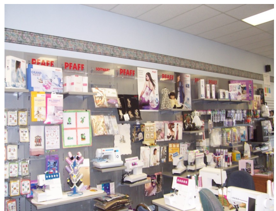
Sound Sewing Silverdale 360-698-4735